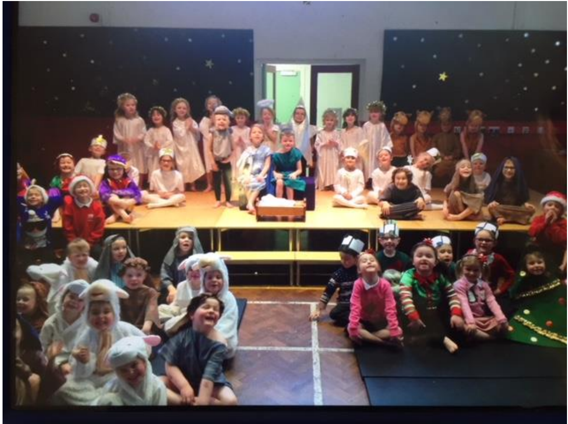
Infant Nativity & members of the Junior cast