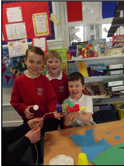
Year 3 pupils creating their Chinese dragons.