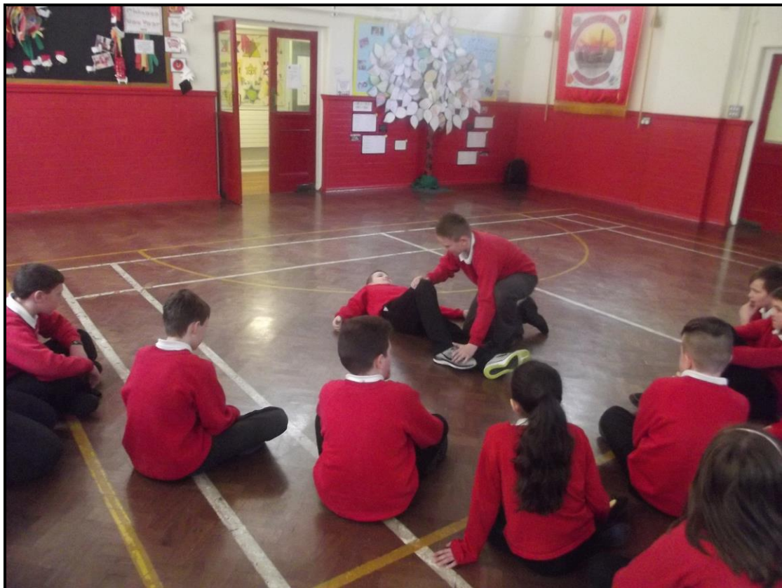
Year 5 and 6 pupils undertook a basic first aid course this month.