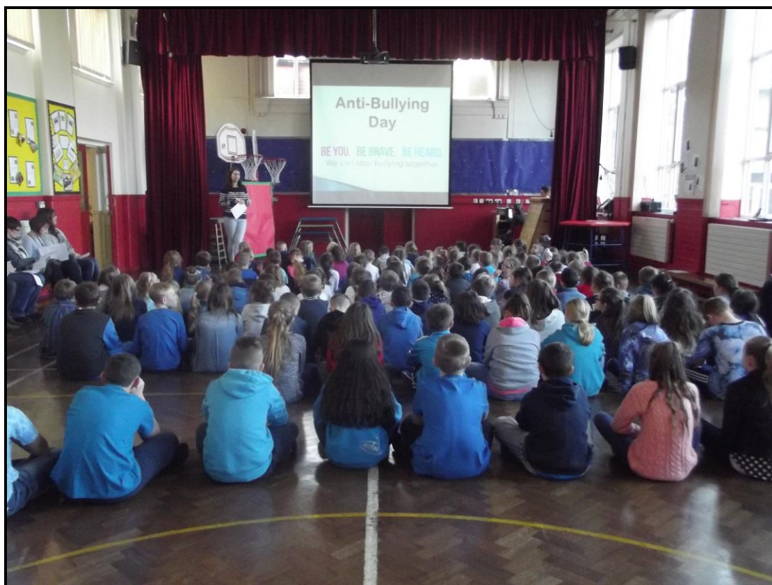
Miss Baird, our PSHE Co-ordinator, launches Anti-bullying day in assembly.