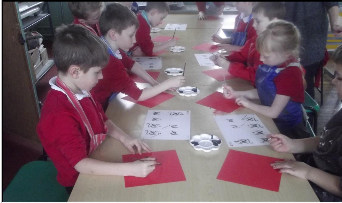
Year 2 pupils participating in Chinese New Year activities in our art and craft room.