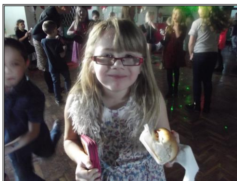
Fun at the Valentine Disco. Thanks again to our band of supporters for their endless goodwill!