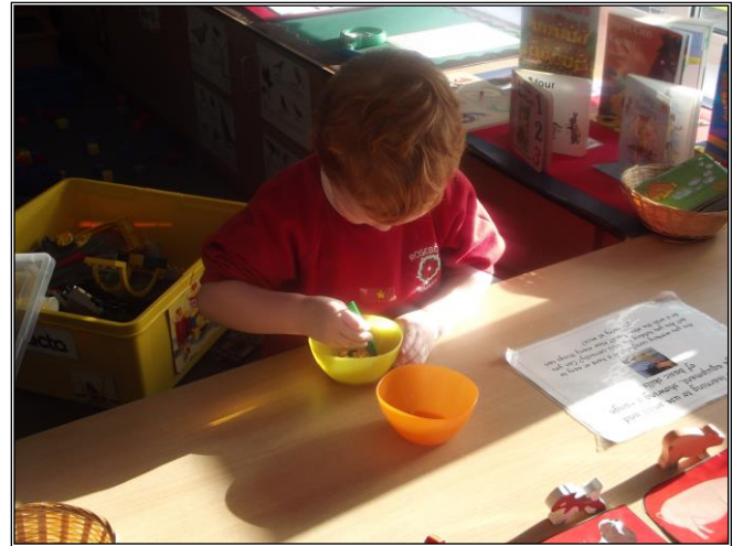
Nursery pupils developing their fine motor skills