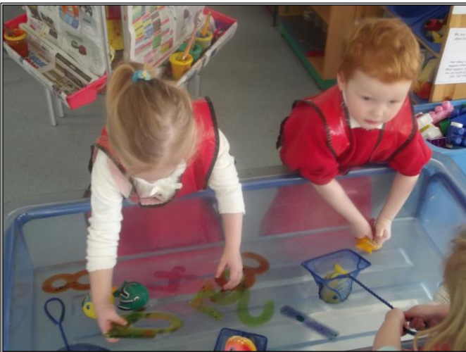
Nursery pupils hard at work.