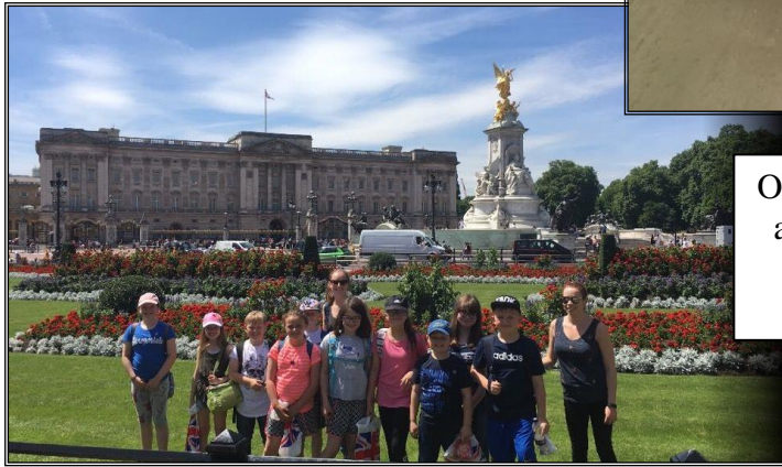
Our culture trip to London was a huge success. The children thoroughly enjoyed themselves!