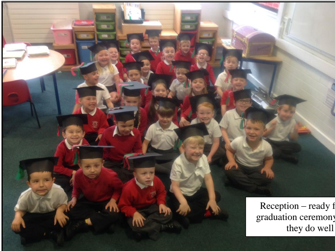
Reception – ready for their graduation ceremony. Didn't they do well!

Please remember Headteachers can no longer authorise holidays in term time due to current government legislation.