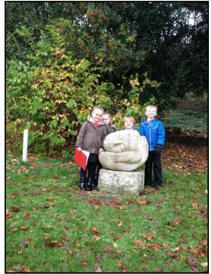
Years 1 and 2 visit Saltwell Park and the Angel of the North, as part of their sculpture topic.