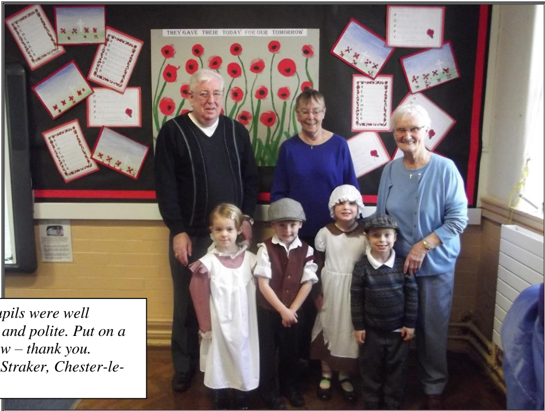
All the pupils were well informed and polite. Put on a great show – thank you. (Alestair Straker, Chester-le-Street)