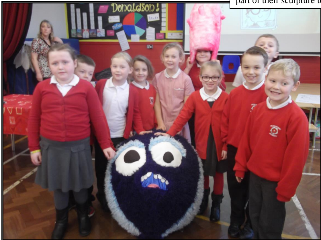
Members of Year 3 during our author visit. Kate Pankhurst visited the school in November and gave the children a fascinating talk about her books. She demonstrated her illustration skills and invited the pupils to join in. Some of our pupils bought a signed copy of the Mariella Mystery stories. Check out our display of the visit in the main hall.