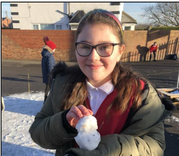
Fun in the snow at playtime.