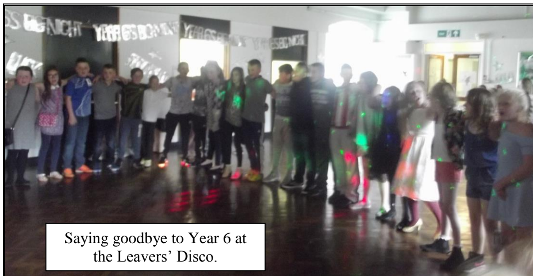
Saying goodbye to Year 6 at the Leavers' Disco.