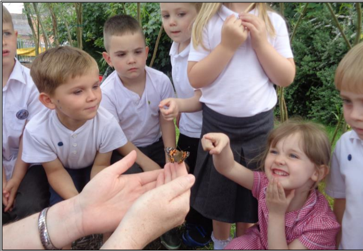
Reception children free the butterflies after they emerge from their chrysalises.

From September, Durham County Council is putting more focus on schools for targeting low attendance. Education Welfare Officers (EWOs), in the past, were responsible for sending attendance letters out to parents. This duty has now transferred to schools. EWOs will now get involved in the later stages of the process. Please remember Headteachers can no longer authorise holidays in term time due to current government legislation.