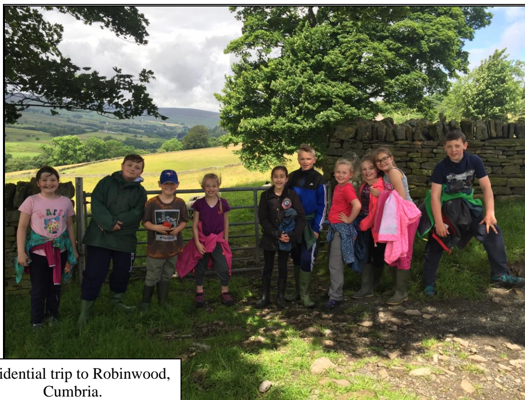
Residential trip to Robinwood, Cumbria.