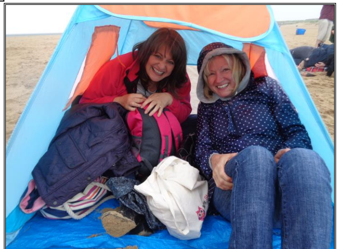
EYFS trip to South Shields