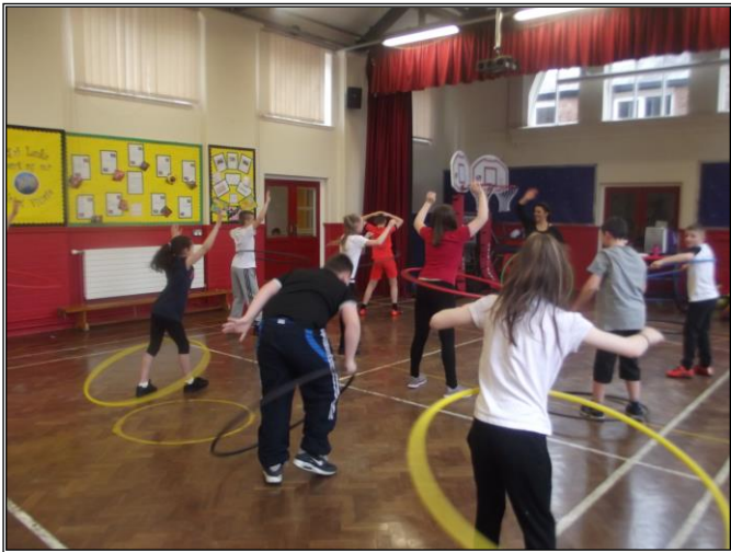
Year 6 during Hoopstarz day