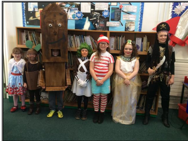
Can you guess who the book characters are?