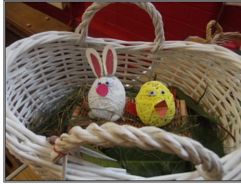
2 nd prize to Paige (Year 1)