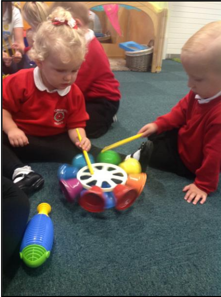
Music in the Ladybirds Nursery