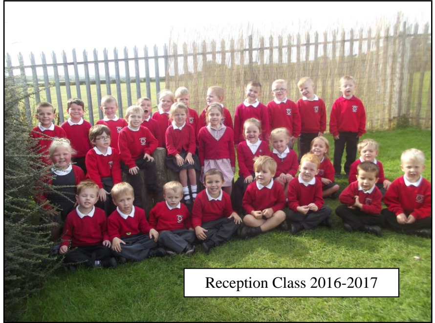
Reception Class 2016-2017