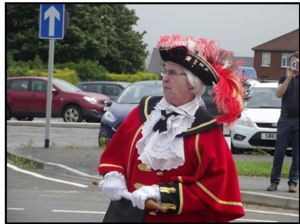
Town crier opens summer fayre

Our youngest children were treated to a visit by a selection of 'party' animals.