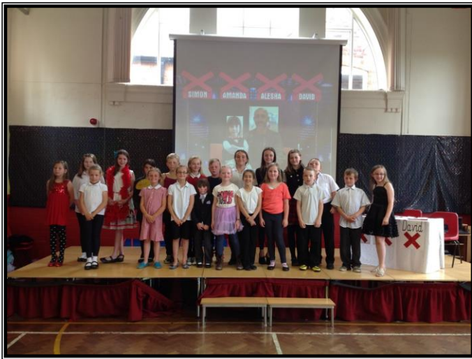
Drama Club 2014