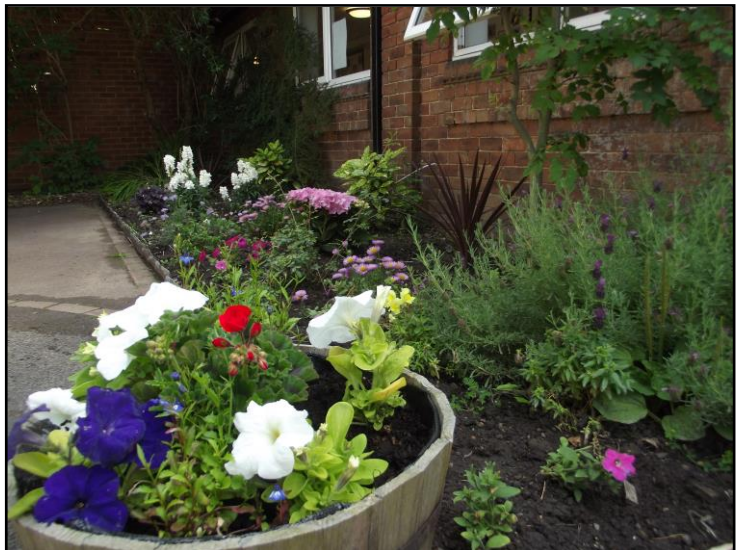
Left - Zoe V handles a tarantula, one of a range of animals, arranged by Sure Start to visit the children in nursery. Other exotic animals included giant tortoises; lizards, geckos and snakes. Above – our newly planted bed in the quadrangle.