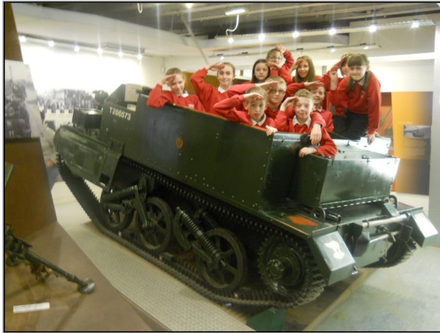
Year 6 pupils