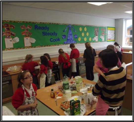
Parents & pupils at Inspire Cookery