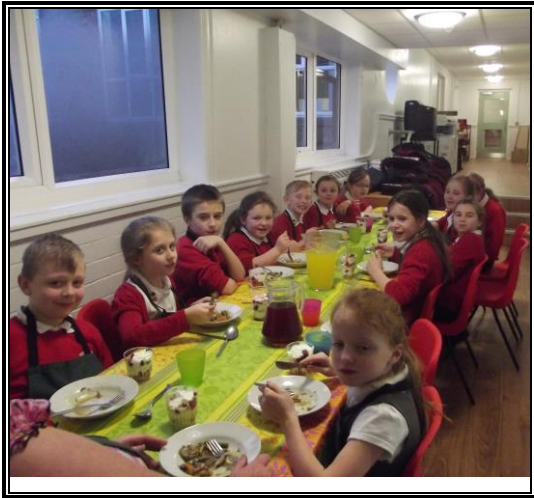
'Roseberry Gets Cooking' Club