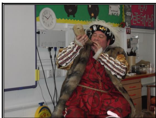
Henry VIII blows his hunting horn

Pupils in Years 3 & 4 had the opportunity to meet Henry VIII as part of their topic on Tudors. They will also be participating in a Tudor banquet during the last week of term and performing a Tudor dance for their parents.