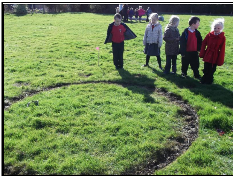
Year 2 pupils investigate the crash site

Please don't be alarmed if your child has been talking about an alien invasion! The pupils have been completing their end of term assessments and for the writing test, they were asked to write about an alien spaceship landing on our school field.