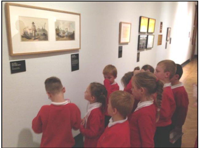
Laing Art Gallery