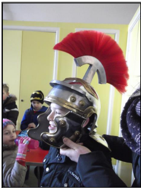
Dressing up as a Roman centurion and creating a mosaic – just 2 of the activities on this interesting excursion!