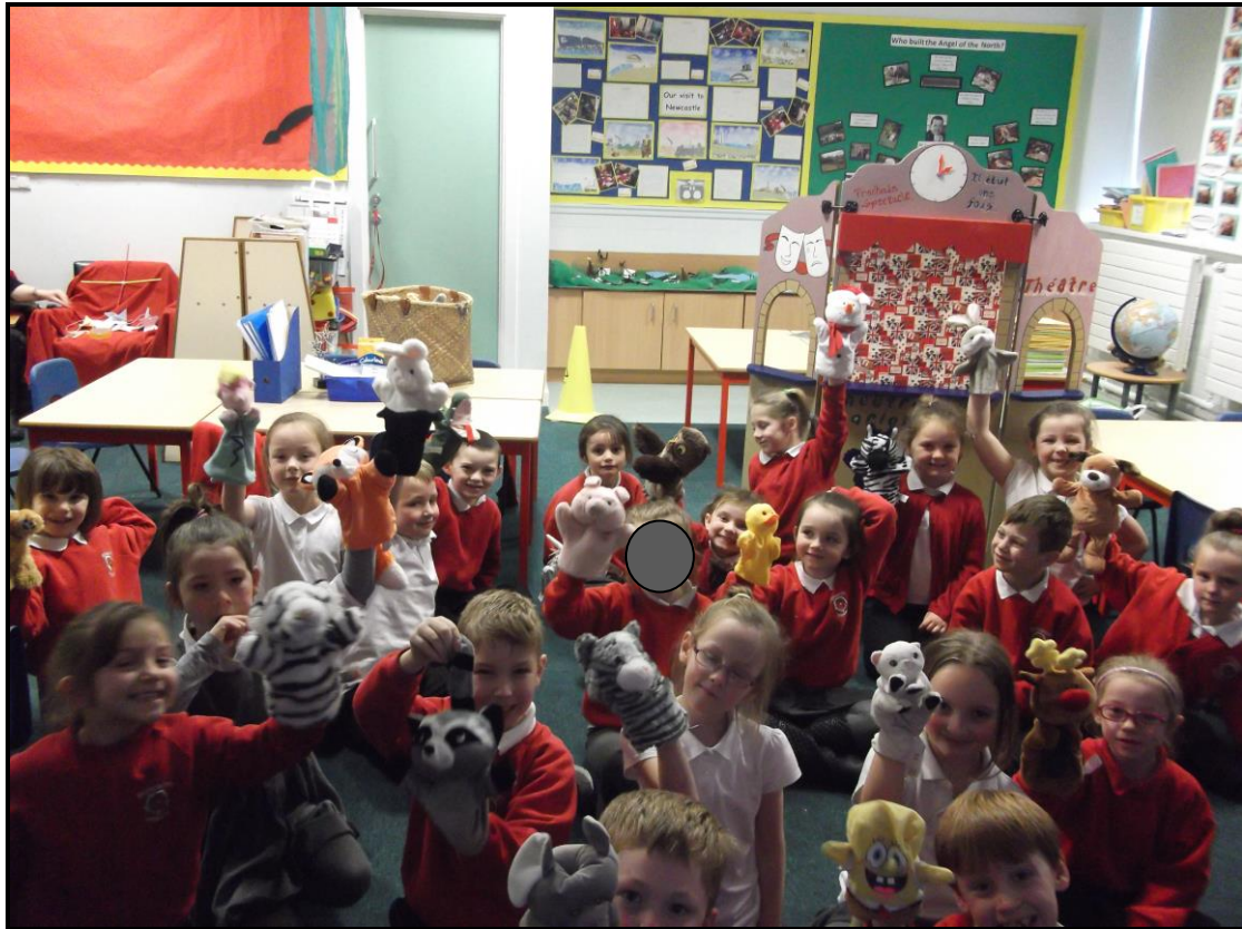
Year 3 pupils using the puppets to develop their conversational French. The children were asking and answering questions about themselves.