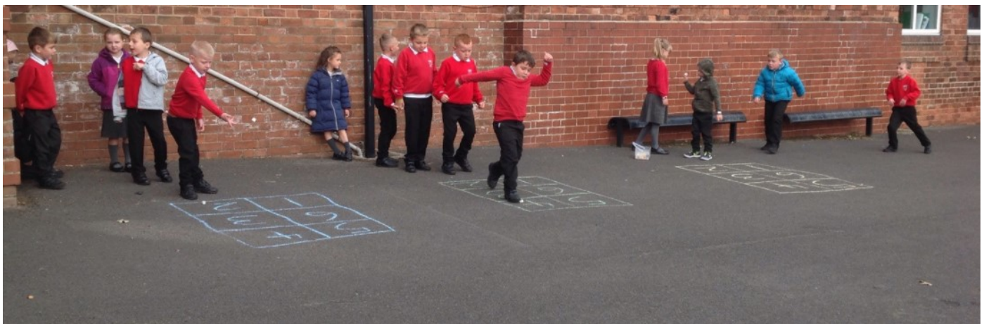
As part of European Languages Day , Year 2 Swifts found out some facts about Poland, played a Polish playground game and learnt how to say hello in Polish.