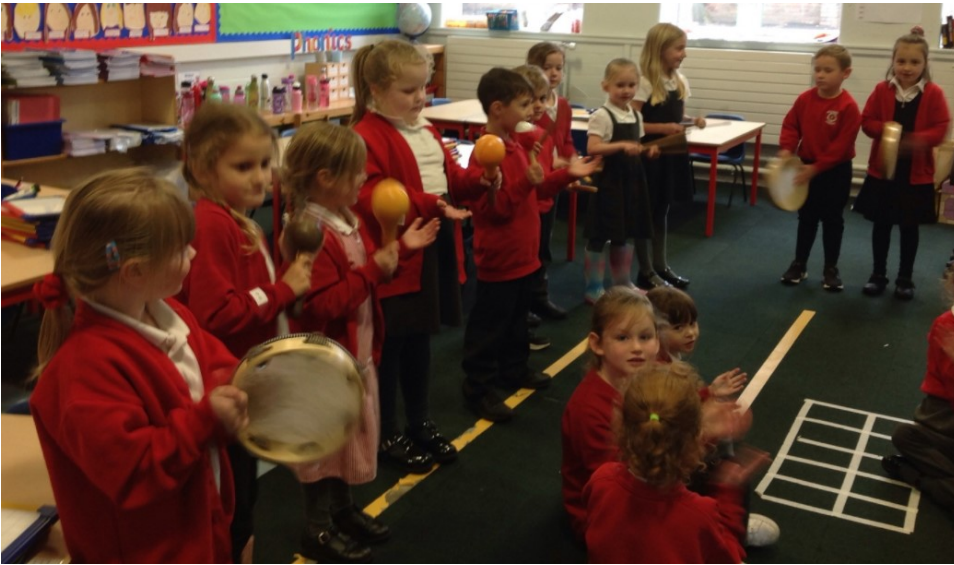
Year 1 Herons enjoying their music lesson where they were learning how to keep a steady beat.