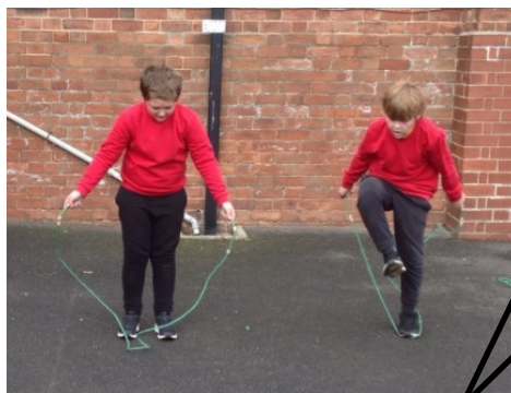
Year 5 were exhausted after their circuits session in P.E. They all worked extremely hard!