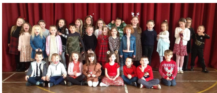
Year 2 Swifts all dressed up for their Christmas party.

Year 5/6 Kingfishers —Patrick for a fantastic term leading up to Christmas.